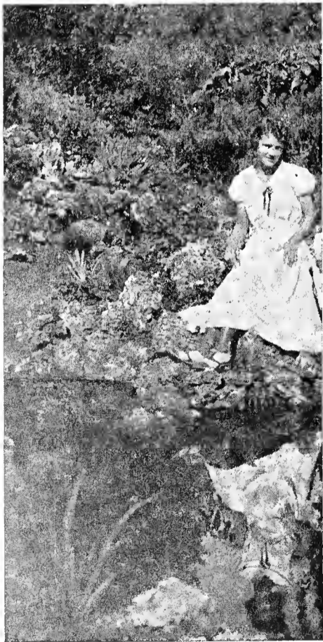
Rock Garden view at Nursery

One might travel for days, and not find a spot so interesting as a carefully built rock garden on his own home grounds.